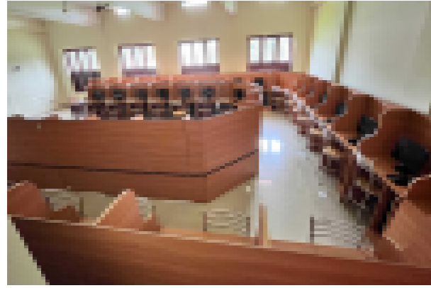
COMPUTER LAB PHOTO